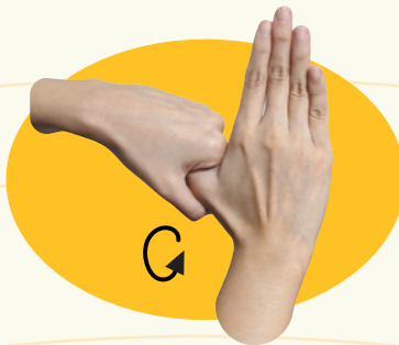
5. Rotational rubbing of right thumb clasped in left palm and vice-versa