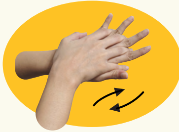
2. Right palm over left dorsum with interlaced fingers and vice-versa