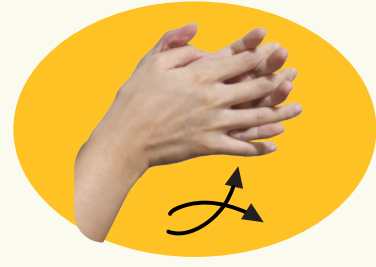
3. Palm to palm with fingers interlaced