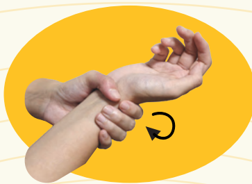
7. Wrap left hand over right wrist using rotational movements up to mid-forearm and vice-versa