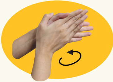
1. Rub hands palm to palm