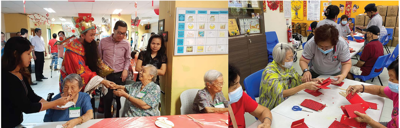
Volunteer dressed up as God of Fortune at St Luke's ElderCare, Telok Blangah during Lunar New Year Celebrations.