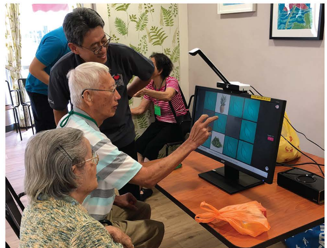
Volunteers guiding the elderly at St Luke's ElderCare, Ayer Rajah at brain teaser games.

Besides supporting various Community Care Organisations, PSA also supported seniors in general by donating $1 million (from 2018 to 2022) for Project Silver Screen, to bring functional screening to seniors in the community as part of the ongoing preventive health efforts to help seniors age well in place.